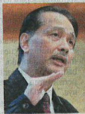
DR NOOR HISHAM

Pulau Pinang mencatatkan 1,655 kes, diikuti Johor (1,526), Kelantan (1,271), Perak (1,229), Sarawak (1,206), Melaka (737), Pahang (736), Terengganu (621), Perlis (42), Putrajaya (26), dan Labuan (sembilan). Ketua Pengarah Kesihatan, Tan Sri Dr Noor Hisham Abdullah berkata, pertambahan itu menjadikan