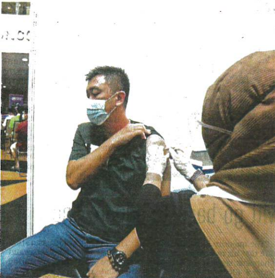
A recipient getting the Covid-19 vaccine under the Retail Industry Vaccination Programme at Dataran Pahlawan Melaka Megamall in Melaka yesterday.

Other states with less than 40 per cent of its adult population fully vaccinated are Johor at 32.1 per cent, Kelantan at 32.6 per cent, Kedah at 33.9 per cent, Pahang at 36.8 per cent, Perak at 36.7 per cent and Terengganu at 38.4 per cent.