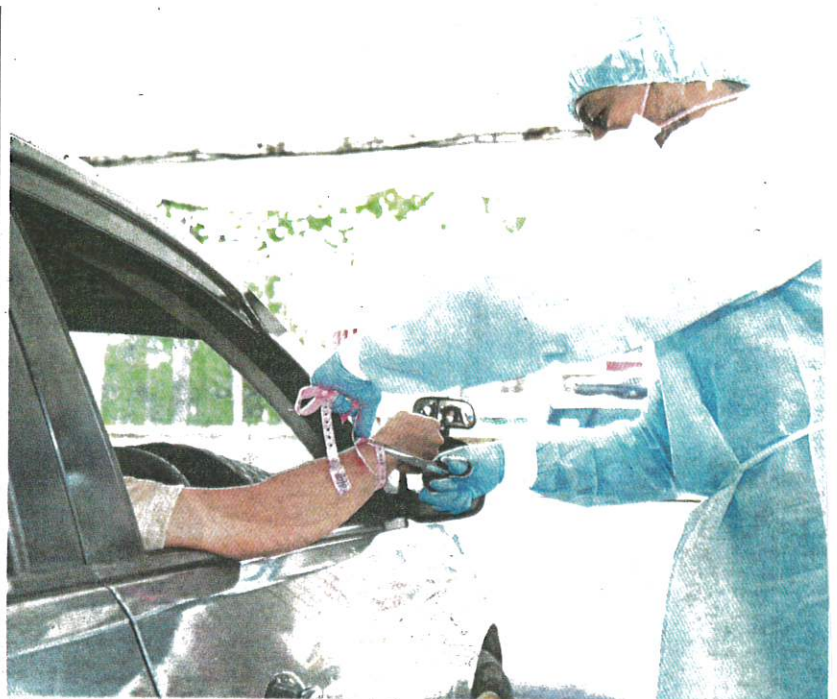
A health worker cutting off the pink wristband of a person who has completed quarantine at the Laman Xtreme parking lot in Pasir Gudang, Johor, yesterday.