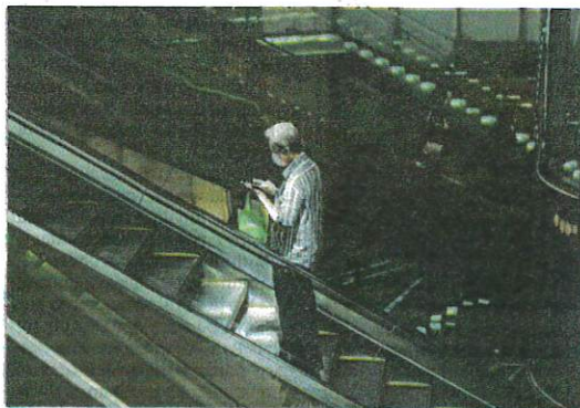
SEORANG lelaki warga emas hadir secara walk-in di Pusat Pemberian Vaksin (PPV) Pusat Konvesyen Kuala Lumpur (KLCC), Kuala Lumpur baru-baru ini.

"Memang perlu masa yang banyak lepas ini, persoalannya